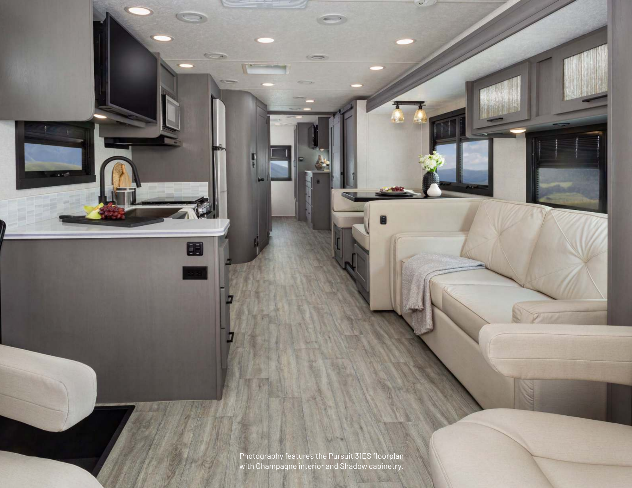
Photography features the Pursuit 31ES floorplan with Champagne interior and Shadow cabinetry.